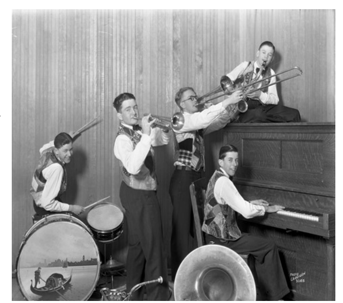
January image: Natrona CHS Pep Orchestra in 1931.

Or, Society Headquarters at linda@wyshs.org