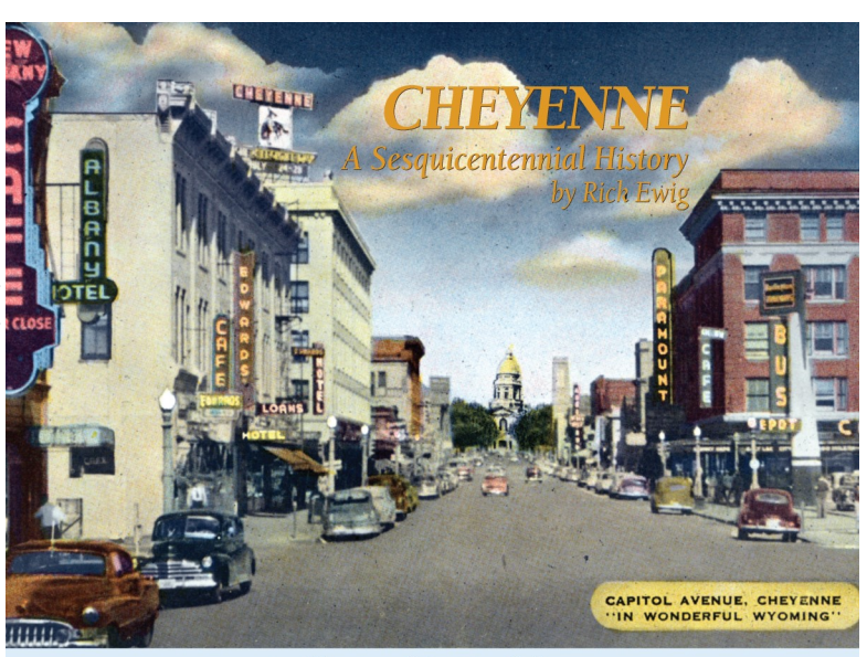
A publication of the City of Cheyenne