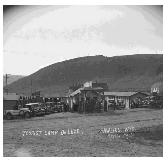
The Deluxe Tourist Camp at Rawlins, Wyoming 1920. From the Frank J. Meyers Papers. 1921. Photo courtesy of the AHC.

Historical photographs from the collections of the American Heritage Center are once again featured in the Society's annual Calendar of Wyoming History. Each image is a visual reminder of how families and communities lived and worked in the early days. A fascinating "this day in history" tidbit is included on every day of the year. For instance, on October 11 in 1952 a 1,400 lb. bear was killed near Buffalo. Another favorite is on October 31, 1890 when a local butcher at Merino was arrested for stealing cattle!