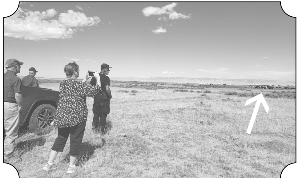
Attendees look on and snap pictures of the Wild Horses of McCullough Peaks excursion north of Cody. The arrow points out the group of horses.