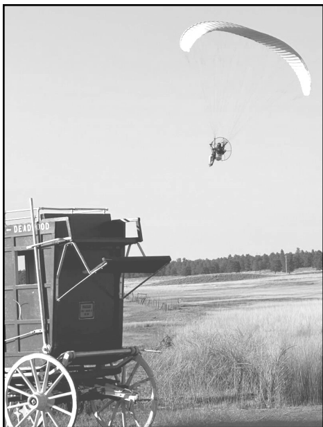
Looking "up" in Upton at the Red Onion Museum, attendees had a taste of the modern and the antique.